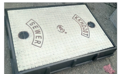
FRP Frame & Concrete Cover