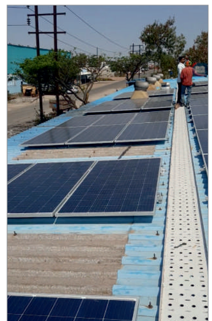
Rooftop Solar Panels