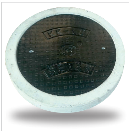
FRP Cover With Concrete Frame

W e are aware that Climate change poses an existential threat to all living species on earth, and we, at KK FRP and Konkrete Private Limited, understand the urgency of being part of the collective effort towards combating the climate crisis. We are aware of the problem that concrete production poses as one of the largest contributors of greenhouse gas emissions, and the